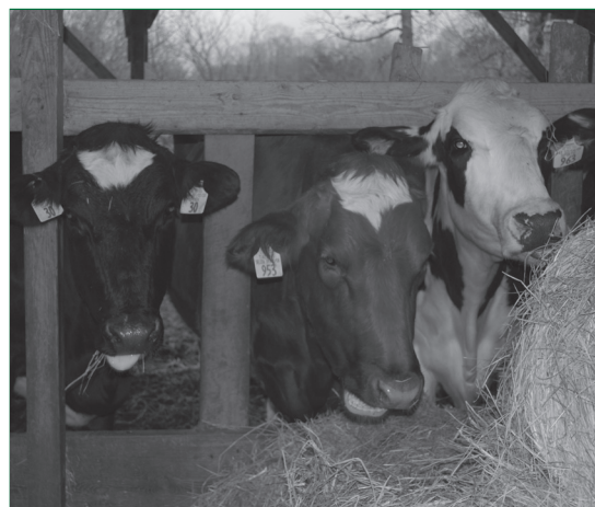
Raising livestock and poultry may affect farmers' risk of getting cancer.

We don't yet know the specific factors responsible for these associations. Farmers who raise livestock and poultry are exposed to many agents that might influence their cancer risk. For example, certain viruses and pesticides have been shown to increase the risk of certain cancers. On the other hand, endotoxins, which are chemicals found in some bacteria, are present in animal facilities and stored grain and are thought to offer some protection against lung cancer.